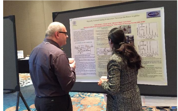
ARFTG attendees discuss with interactive forum presenters.

GmbH and Dr. Mühlhaus Consulting & Software GmbH). Congratulations to our best paper awardees.