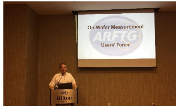
ARFTG hosted the inaugural On-Wafer Measurement Users' Forum.