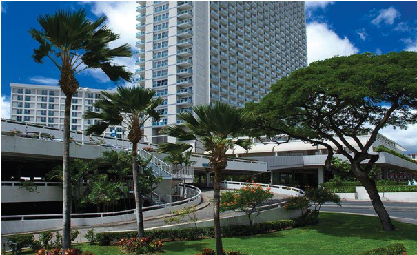
The Ala Moana Hotel, site for the 89 th ARFTG Microwave Measurement Conference.

Frequencies; IEEE P1765, Recommended Practice for Estimating the Uncertainty In Measurements of Modulated Signals for Wireless Communications with Application to Error Vector Magnitude and Other System-Level Distortion Metrics, and IEEE P1770, Recommended Practice for The Usage of Terms Commonly Employed in the Field of Large-Signal Vector Network Analysis.