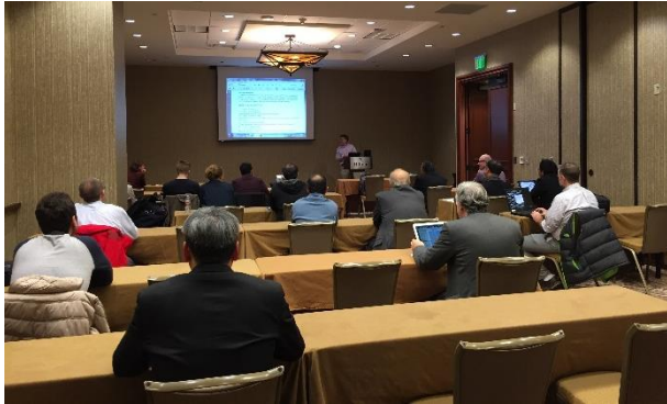
A workshop on PA Design Techniques for Future Wireless Systems was presented at the Fall Symposium.