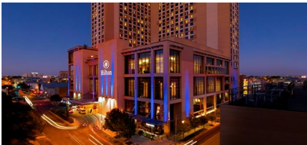
Hilton Austin, location of last fall's ARFTG Symposium

The Fall 2016 ARFTG Microwave Measurement Symposium took place at the Hilton Austin in Austin, TX. The event was held over four days: Tues., Dec. 6, 2016 to Fri., Dec. 9, 2016. The Symposium consisted of a short course on introduction to power amplifier design, an on-wafer measurement users' forum, an NVNA users' forum, a workshop on power amplifiers, and the main conference. The theme of this year's symposium was "Power Amplifiers and Systems Design for Wireless Applications". The main event was the 88 th ARFTG Microwave Measurement Conference, which took place on Thurs. and Fri. In addition to these technical events, there was an awards banquet on Thurs. evening and a vendor exhibition during the conference. Taken together, this amounted to four days of exciting activities for engineers, scientists, and technologists.