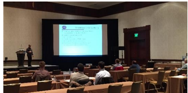
The Short Course introduces attendees to a wide range of power amplifier design and characterization topics.