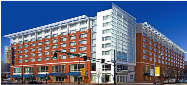
Georgia Tech Hotel and Conference Center, location of the Fall 2015 ARFTG Symposium

The Fall 2015 ARFTG Microwave Measurement Symposium took place at the Georgia Tech Hotel and Conference Center in Atlanta, GA. The event was held over four days from Tuesday, December 1 st to Friday, December 4 th . The Symposium consisted of a 1½ day short course on microwave measurements, a workshop, an NVNA users' forum, a visit to Georgia Tech, and the main conference. The theme of this year's symposium was " Microwave Measurements with Applications to Bioengineering and Biomedicine ". The main event was the 86 th ARFTG Microwave Measurement Conference, which took place on Thursday and Friday. In addition to these technical events, there was an awards banquet on Thursday evening and a vendor exhibition during the main conference. Taken together, this amounted to four days packed with exciting activities for RF, microwave, and millimeter-wave engineers and technologists.