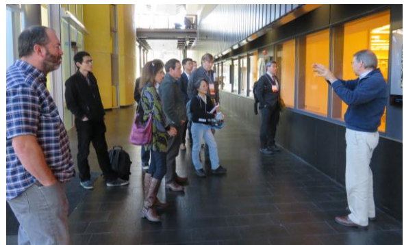
ARFTG attendees visiting Georgia Tech cleanroom.