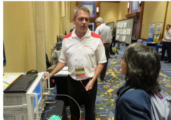
ARFTG allows for extensive interaction between attendees and exhibitors.

To exhibit at a future conference, please contact the Exhibits Chair, at exhibits@arftg.org .