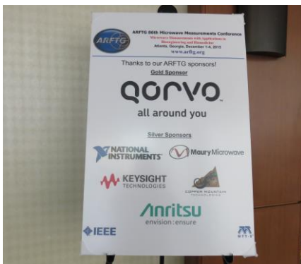
Thanks to the ARFTG sponsors!

For future sponsorship opportunities, contact the Sponsorship Chair, at sponsorship@arftg.org .