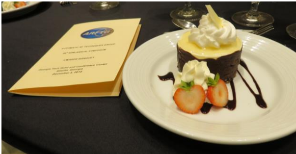
ARFTG Awards Banquet: place for social interactions.