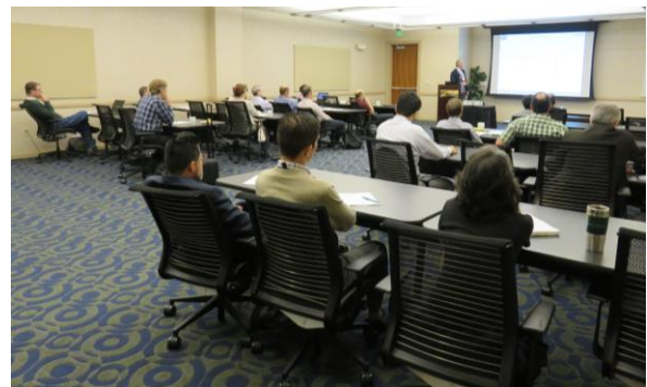
The Short Course introduces attendees to a wide range of microwave measurements topics.

A course on practical microwave measurements, organized by P. Roblin, was held on December 1 st -2 nd . About 14 people attended this course with topics covering everything from power, S-parameter, noise, oscilloscope, and spectral measurements to mm-wave and on-wafer techniques, nonlinear characterization, and load pull. We are very appreciative of the twelve instructors who made this short course successful.