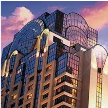
The Marriot Marquis Hotel, site for the 87 th ARFTG Microwave Measurement Conference.