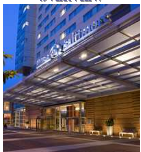
The Baltimore Hilton, venue for the 77<sup>th</sup> ARFTG Microwave Measurement Conference

More than 110 attendees participated in the 77<sup>th</sup> ARFTG Microwave Measurement Conference that took place at the Baltimore Hilton on June 10<sup>th</sup>, 2011. As is usual for Spring ARFTG conferences, this conference formed part of Microwave Week 2011, which also included the International Microwave Symposium (IMS), the Radio Frequency Integrated Circuits (RFIC) symposium, and many workshops, tutorials and other meetings. All these events took place at the Baltimore Convention Center or the Baltimore Hilton. As well as its conference, ARFTG also sponsored a meeting of the NVNA Users' Forum and three joint ARFTG/IMS Workshops. Taken together, these activities ran from Monday, June 6<sup>th</sup> through to Friday, June 10<sup>th</sup>.